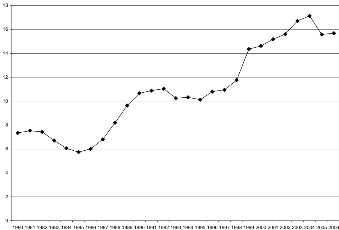
Figure 1. WPs as a share of the total publications in EconLit. Percentages are shown as moving averages of three years.

Figure 1 shows an increase in the relative size of WPs. Their percentage of the publications in EconLit has increased from about 7 percent in 1980 to about 16 percent in 2006. This study analyses data in the ten-year period from 1996 to 2005 and in this period the share of working papers is increasing from about 10 percent to 16 percent.