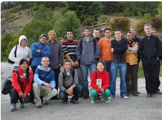
Fig. 2 The group of students in 2007-2008

Concerning the European partnerships, in addition to the three partners who sent us students within the framework of the Erasmus exchanges, twenty-eight other partners expressed an interest in our proposal. Hopefully they will be real partners in the future.