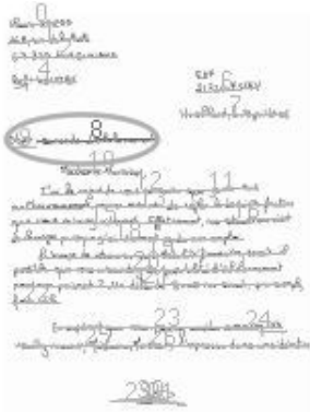
(a) Detection of lineSegment number 8 at low resolution