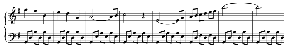
Fig. 1. Polyphonic excerpt of Swan Lake by Tchaikovsky.

represent a chord composed of n_2 and a tied note n'_1 , where n'_1 has onset time o(n'_1) = o(n_1) , pitch p(n'_1) = p(n_1) but with a smaller duration d(n'_1) :