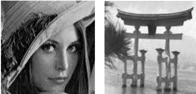
Fig. 1. Original Lena and Door images, 128x128 pixels

We present results of the regularity-based interpolation on two images. The first one is the well-known Lena image, the second is a scene containing a Japanese door ( toryi ). Both original images are 128x128 pixels and are shown on figure 1. Figure 2 displays a comparison between four-times bicubic and regularity-based interpolations on a detail of Lena. Figure 3 presents eight-times bicubic and regularity-based interpolations on a detail of the door image.