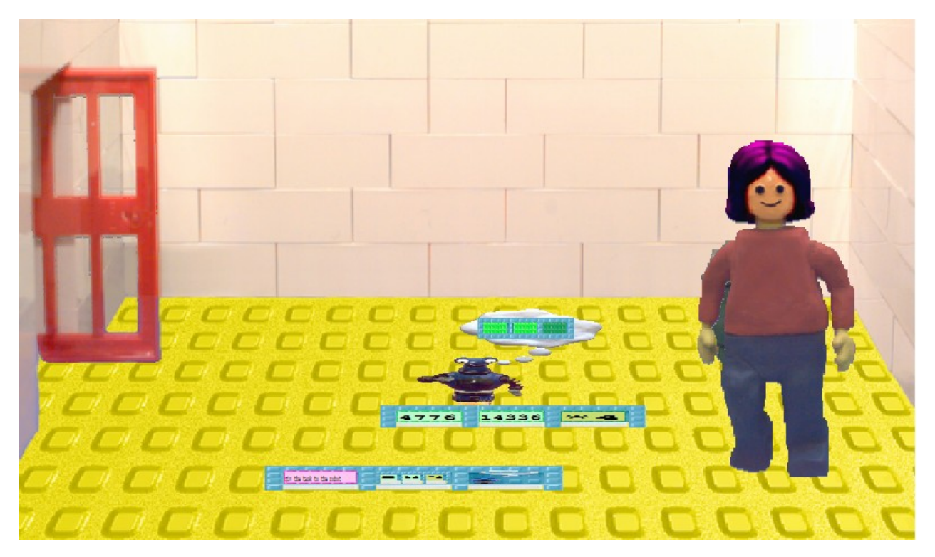
Figure 1: The ToonTalk programming environment. The programmer's avatar is on the right, and a robot generating a sequence of numbers in the centre.

ToonTalk (Figure 1) is a language and a programming environment designed to be accessible by children of a wide range of ages, without compromising computational and expressive power. Following a video game metaphor, the programmer is represented by an avatar that acts in a virtual world. Through this avatar the programmer can operate on objects in this world, or can train a robot to do so. Training a robot is the ToonTalk equivalent of programming. The programmer leads the robot through a sequence of actions, and the robot will then repeat these actions whenever presented with the right conditions. ToonTalk programmes are animated: the robot displays its actions as it executes them.