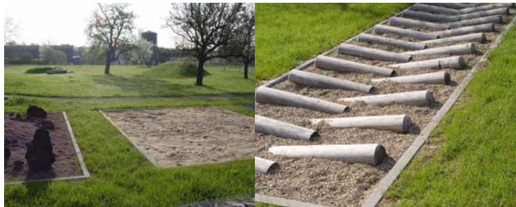
Fig. 4. The rover test area of University Würzburg

Depending on conditions of the particular test area like roughness, traction and inclination, the configuration of the basic drive assistance and the composition of autonomous reactions were adapted. All tests were accomplished