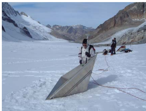
Figure 3 : Measurement of the position of a corner reflector by GPS (Argentière glacier).

Figure 3 shows a corner reflector used for the radar acquisition in L-Band. These calibration targets are necessary for the geocoding and for the processing of the radar images acquired by the DLR. Accuracies of 1-4cm in X, Y and Z on the measured points can be reached from such GPS surveying techniques.