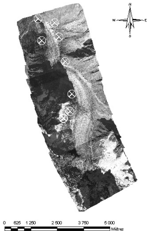
Figure 1. Set of the photos taken over the Mer de Glace in 1995. Circular marks represent the GCPs measured by GPS.

In the first step of the processing, the digital images are orientated by using the bundle block aerial triangulation (AT) technique, well known processing in the photogrammetric domain. Aero-triangulation is an extension of stereo-restitution methods that enables a global restitution of a block of photos and the reduction of ground control points. Bundle block adjustment is an iterative method based on the use of photo coordinates as observations. Then, the application of the central projection method enables the conversion of these observations into terrain coordinates in one step [4]. This requires a block of photos with at least 60% overlap and 20% side-lap (often more) and a set of GCPs located on both sides of the glacier. Figure 1 shows the location of GCPs entering in the aerotriangulation process superimposed on the block of photos.