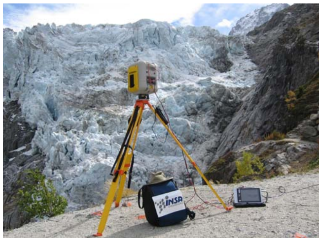
Figure 7. Laser Scanning of the glacier front