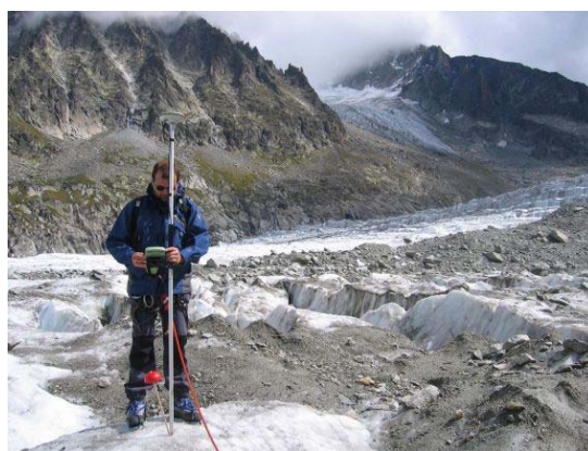
Figure 4. Rapid static GPS measurements (Mer de Glace)

In September 2005, GPS profile measurements have been carried out on the Leschaux glaciers located ahead of the Mer de Glace on points marked beforehand on the glacier (Figure 4). In this way, GPS measurements on 23 points along a longitudinal profile of 1700 meters located between altitudes of 2100m and 2300m have been achieved during 3 consecutive days. Figure 5 presents the displacement vectors, where the direction of the displacement is represented by an arrow and the length of the vector is indicated in meters next to the arrow.