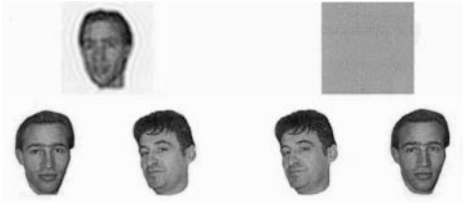
Fig. 2. Example of stimuli used in the high- (right side) and low-pass filtered (left side) condition in experiment 2.