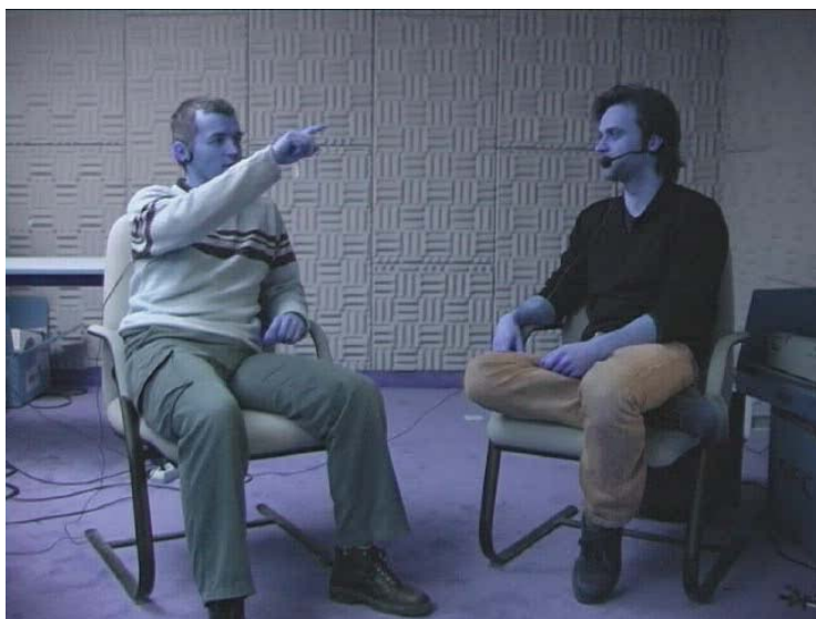
Figure 1: Introducing a physical object into the communication process by means of pointing.

et al., forthcoming 2007) that these types of movements play a role in the communication process and if a head nod may be interpreted differently from a vocal backchannel, it is nevertheless perceived as a minimal response from the interactant. Therefore, it makes sense to annotate these body movements, which are under-specified as compared to hand gestures. It may also make sense to include in the annotation physical objects present on the scene of recording and to which participants may refer to in the course of their interaction by means of deictic pointing and referential verbal expression since the physical object suddenly enters the communication process. This phenomenon occurred in our corpus as in the following example: