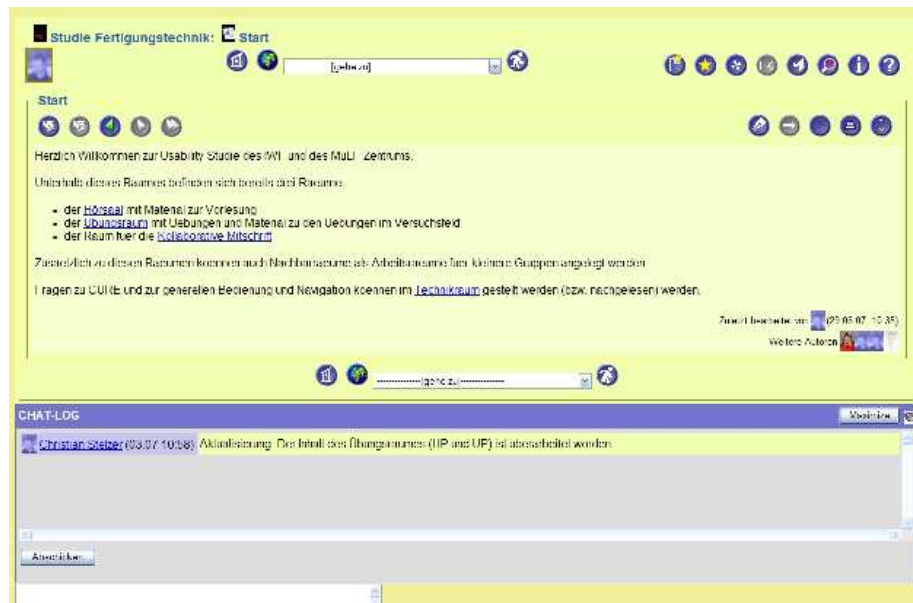
Fig. 2 Start page of the entrance room of the study

All participants were freshman students of Mechanical Engineering at the Institute for Machine Tools and Factory Management (IWF) at Technische Universität Berlin (TU Berlin). They had no previous knowledge on working within virtual cooperative knowledge spaces but had already worked at least with some classical content management systems (amongst others with Moodle[11]).