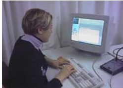
Laboratory room 1