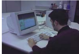
Laboratory room 2