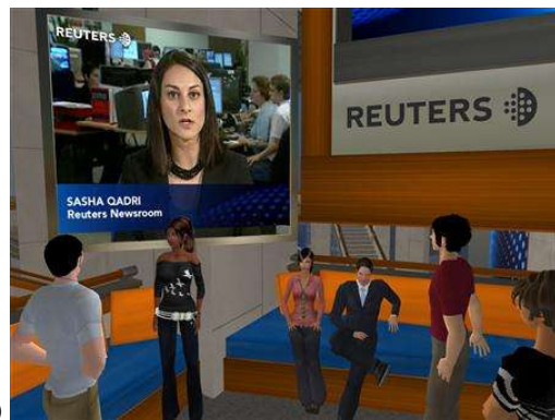
Fig. 3 a) Virtual visiting of the Washington Monument [14]; b) Reuter's virtual news bureau [3]

One interesting aspect of several of these worlds is that they give their users tools that allow them to change the virtual world itself: editing tools (see Fig. 4). Virtual Worlds can, this way, be built from the ground up and developed by its users (players). It is even possible for users have property rights over virtual objects they create, as is the case of Second Life.