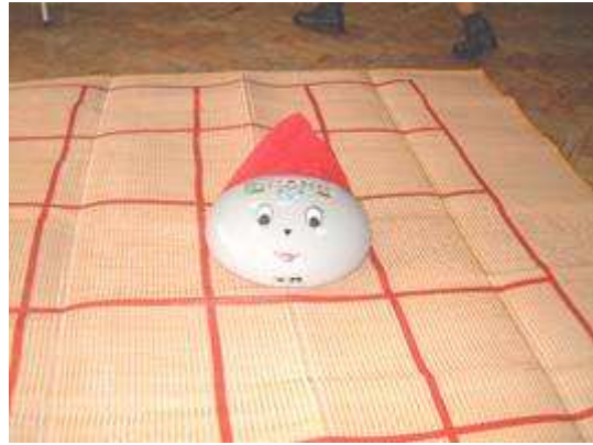
Figure 4 - Little Red Riding Hood

With this setting, Little Red Riding Hood (the Roamer robot) should take the path from its home to grandma's (math domain), going through the story events. During the retelling experience (drama and music domains: the children that wanted to watch a child operating the robot had to sing the Little Red Riding Hood song), by operating the robot, the children had to employ the notions of left/right, direction (forward/back), and quantity, to mention a few. In doing so, they were also developing a strategy to reach their goal (figure 5).