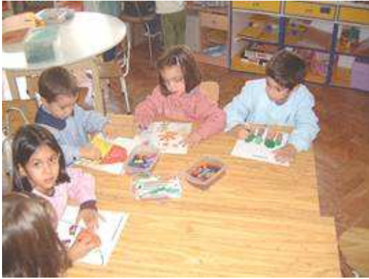
Figure 3 - Drawing the story

domain). Afterwards, the robot was disguised as Little Red Riding Hood, result is shown on figure 4 (plastic expression and drama domains).