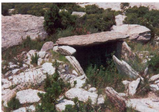
Figure 5 : Orca dolmen.