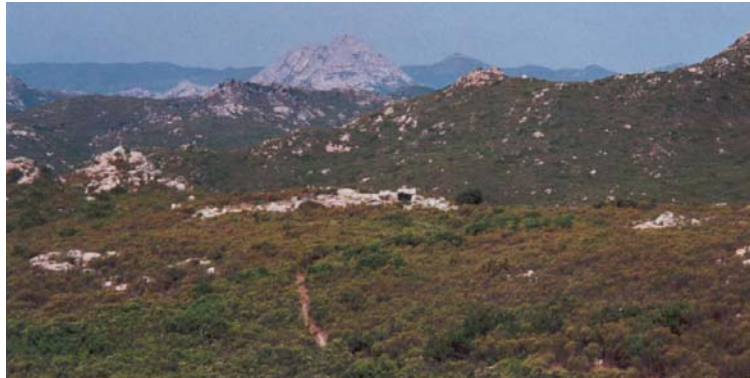
Figure 2 : northwest view from “Cima di Suarella”

The giant was very clever. It is said that he knew everything that could be learned at the time. Furthermore he was very powerful so that the people from Santu Petru di Tenda village living near the place called Casta decided to kill him. But he was difficult to catch so that they had to draw the giant into a trap. There is a place near Bocca Pivanosa where the Lurcu was used to come to drink the water of a spring. At night they put a pair of shoes full of pitch in order to capture him. The next morning the Lurcu came to drink and tried the shoes. The people from the village took him easily because of the shoes he was not able to run away. They were going to kill him near the place where there was the water, when the Lurcu told them a secret in order not to be killed: how to do a special cheese (called Brocciu) with sheep milk. After telling them this secret, he was going to tell another secret: what to do with the rest of the milk when the Brocciu has been done. But the mother from the plateau shouted in Corsican language: “Ùn palisà, chì tantu s'ì mortu” that means “Don't tell them anything because in any case they are going to kill you”. They killed both the Lurcu and his mother. They buried the Lurcu near Bocca Pivanosa and the mother near Bocca Murellu. People can find two early non-dolmenic tombs.