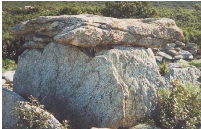
Figure 4 : The Lurcu dolmen

The pictures of the two main dolmens of the legend are given in figure 3 (Lurcu dolmen) and figure 4 (orca dolmen).