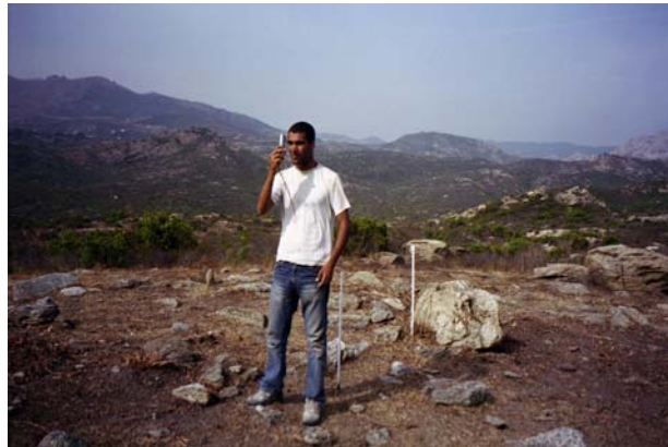
Figure 6 : Measurement of azimuth and angular altitude on Cima suarella