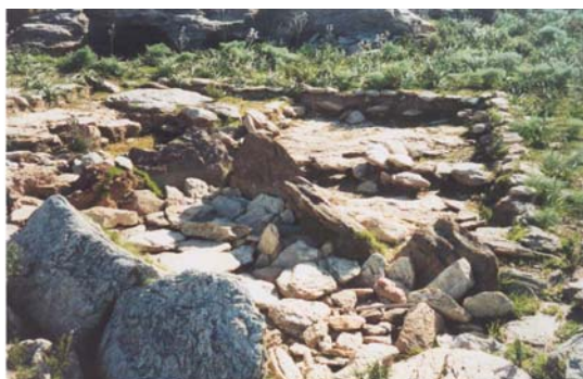
Figure 7 : Megalithic structure on Cima Suarella, Monte Revincu

site organized by F. Leandri ; (ii) Definition of a common interdisciplinary project around Nebbiu Megaliths involving archaeology, Anthropology, GIS, 3D modelling representation, astronomy, Geology) Furthermore we are performing a set of cross-analysis in order to study the links between the megaliths structures of the plateau, the megaliths evidence that archeologists found on the top of Monte Ghjenuva (see figure 2) , the menhirs of Mamucci and the legends around the two dolmens. We give figures 7 an example of a structure which can be found on the plateau. Figure 7 points out a rectangular structure which seems to be an habitation and found on Cima Suarella.