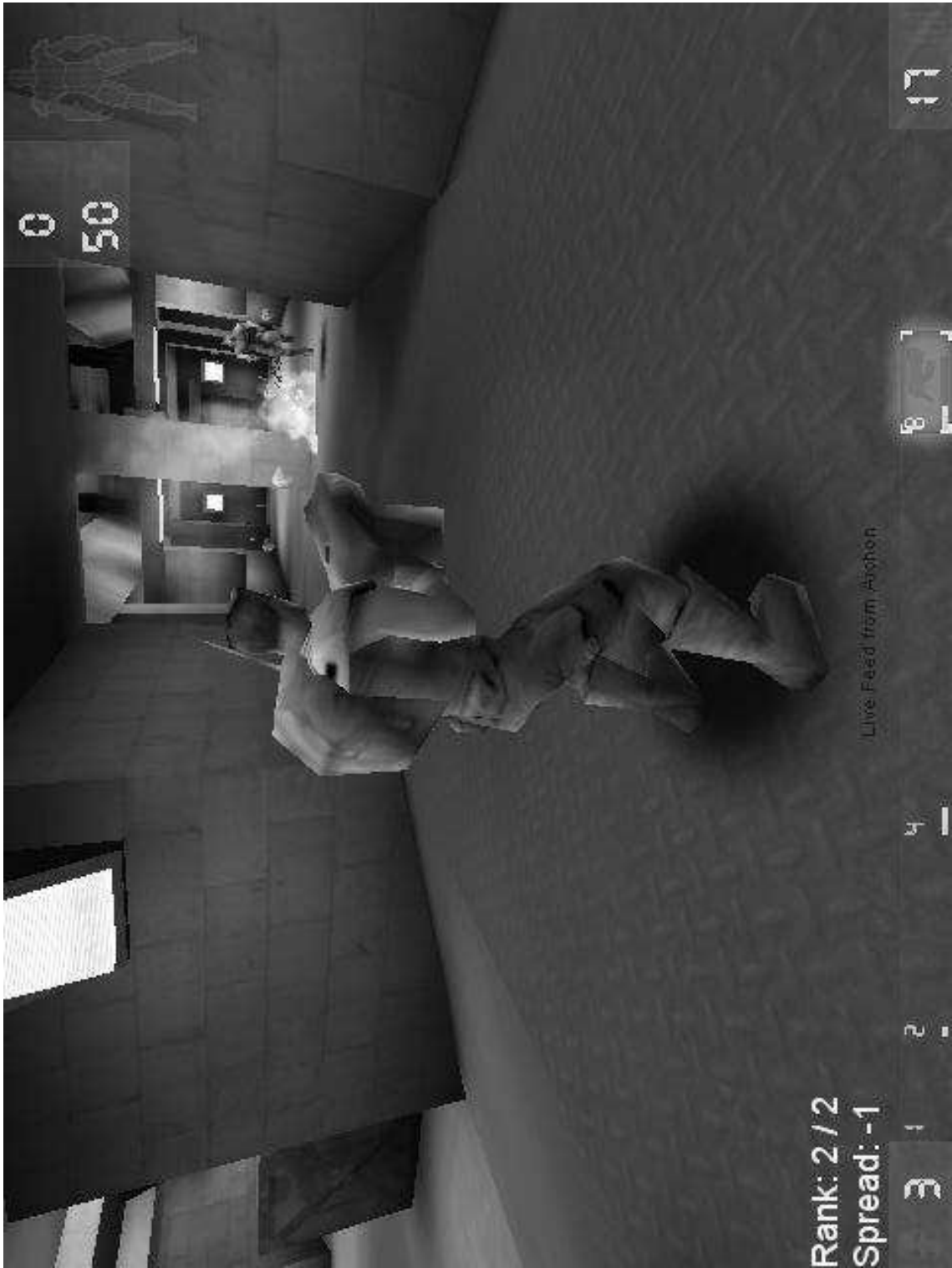
Fig. 1. Unreal Tournament and the Gamebots environment.