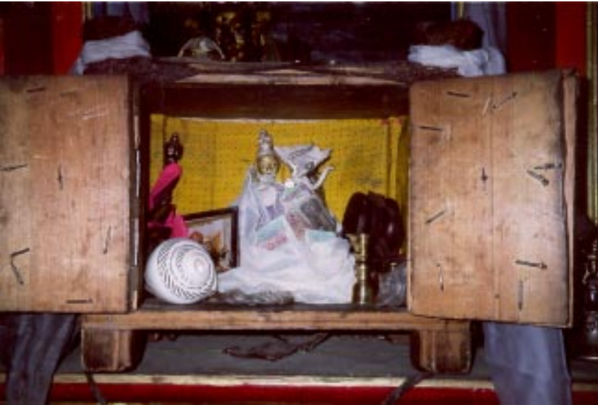
Fig.7. Thang stong rgyal po's box (thang rgam). Par, Spiti, 2001.