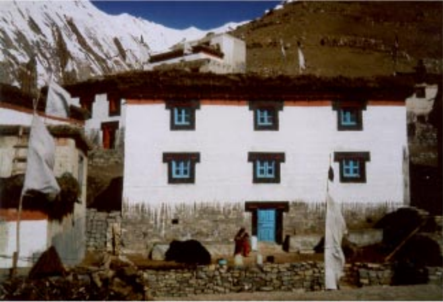
Fig.6. The house of buchen Dorje Puntsog. Mud, Spiti, 2001.