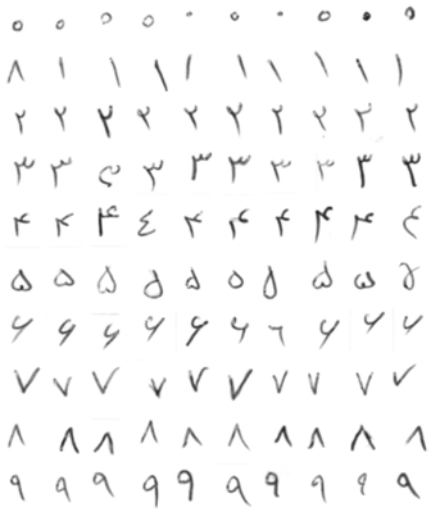
Figure 6. Handwritten Farsi digit samples.