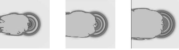
Figure 1: Euclidean norm of \xi at t_1 = 1.5s and t_2 = 1.75s and t_3 = 2s . Case s = 0

In this first experiment, we simulate a wave initially excited by a rotational source located in the center of the domain, in the presence of a horizontal uniform flow with M = 0.5 . The first simulation shows that the method is not stable if the equation is not regularized ( s = 0 ).